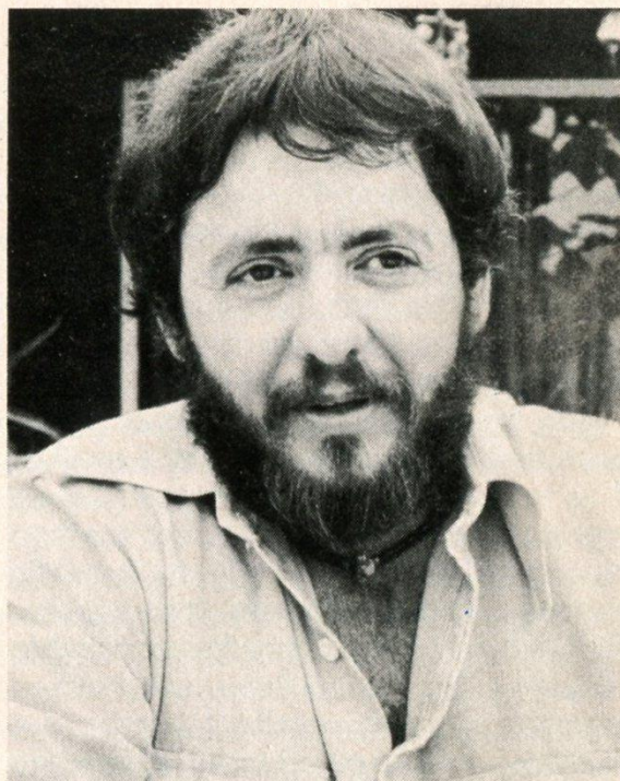
and a transformed man.

In addition, ovulation and menstruation, the latter a particularly painful embarrassment to a would-be man, stop. (One pre-operative man I interviewed skipped his injections for a few weeks and woke up one morning aghast at the onset of a menstrual period.) As the larynx expands, the newly-emerging male undergoes a change of voice similar to that experienced by adolescent boys as the hormone causes the larynx to expand. Jude, a burly, black-bearded 37-year-old transsexual, remembers that in only two